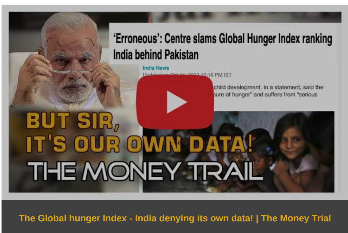
The Global hunger Index - India denying its own data! | The Money Trail